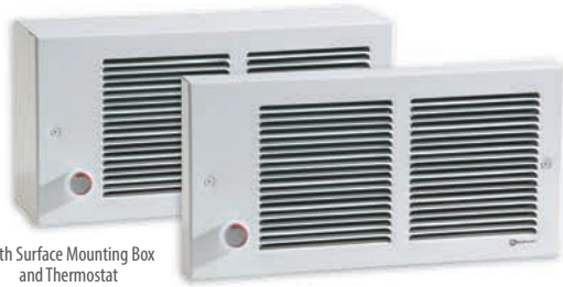
With Surface Mounting Box and Thermostat