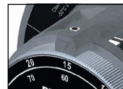
Dial locking screw