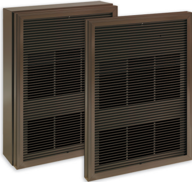
With surface mounting box