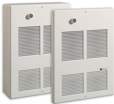
With surface mounting box