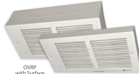
OVRP with Surface Mounting Box