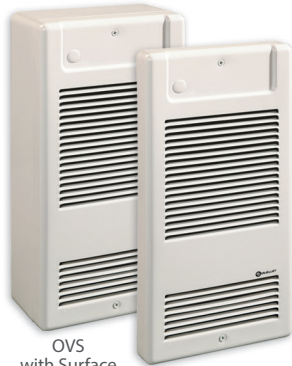
OVS with Surface Mounting Box