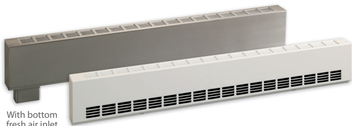
With bottom fresh air inlet and pedestals