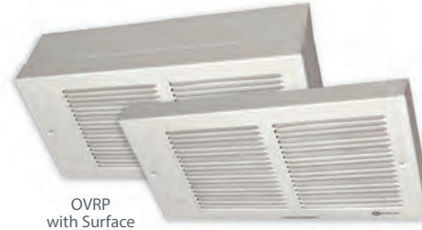
OVRP with Surface Mounting Box