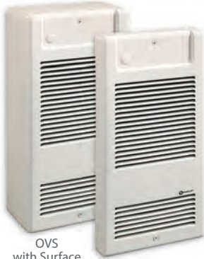
OVS with Surface Mounting Box